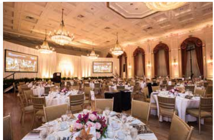
The Concert Hall at the Fairmont Royal York in Toronto.