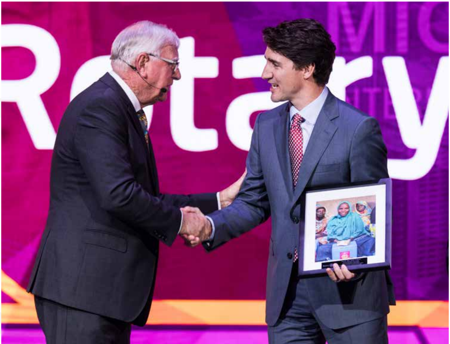
Canadian Prime Minister Justin Trudeau accepts Rotary’s Polio Eradication Champion Award in recognition of Canada’s contributions to polio eradication.

Before the start of the convention, nearly 1,000 Rotarians, Rotaractors, and other peace leaders gathered to discuss the power of peace at the two-day Rotary Peacebuilding Summit. Learn more about this event and all of the convention news on Rotary.org .